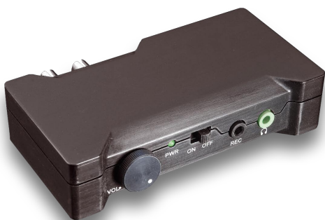
Optional internal recorder